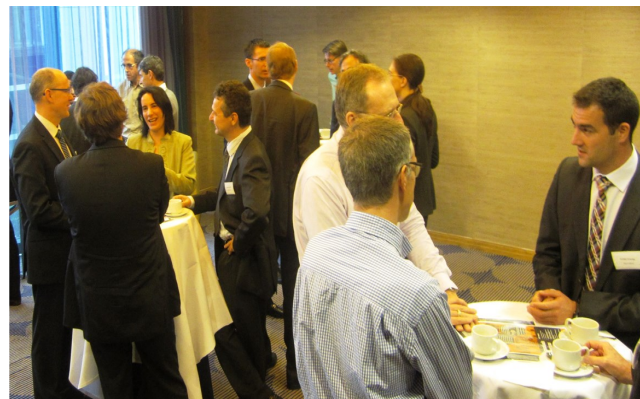
Afternoon refreshments & networking break at European Base Oils & Lubricants Summit, 14 –15 September, 2016, Warsaw, Poland

Tel: +44 (0) 2031410607 Email: mlampropoulou@acieu.net